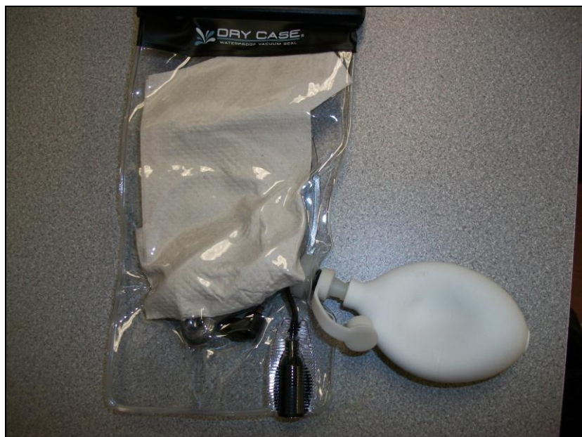
Photograph 3. Overpressure, Small Case, Pretest