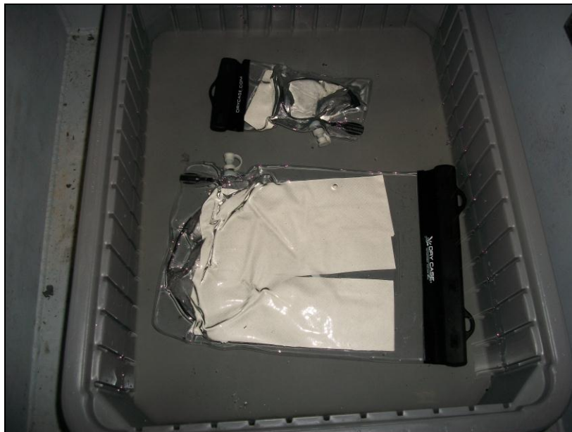
Photograph 1. Overpressure, Test Setup