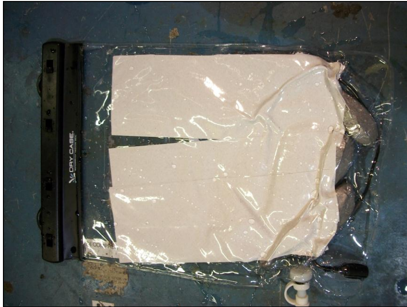
Photograph 4. Overpressure, Large Case, Post Test Inspection