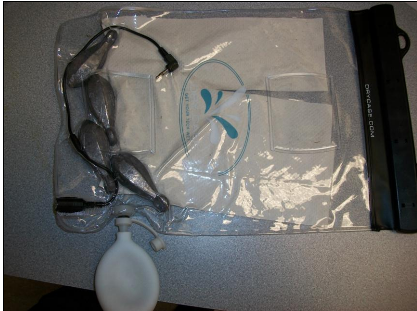
Photograph 2. Overpressure, Large Case, Pretest