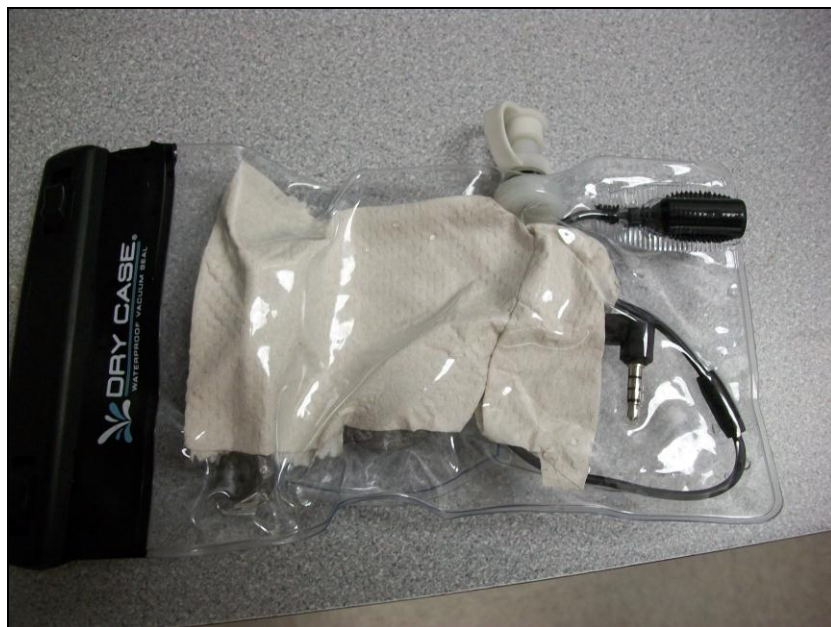
Photograph 5. Overpressure, Small Case, Post Test Inspection